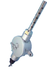
Wall-mount type for low temperature

Also the other various kinds of RTD available.