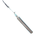
Wire anchor for thermal storage tank