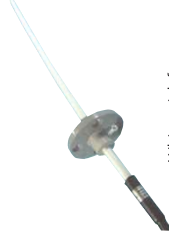
White stick for chemicals