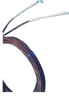
Surface thermocouple sheet