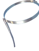
Ring sensor for wiring surface